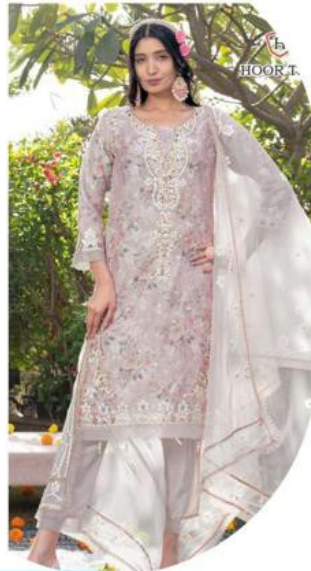
TEXTILE DEAL H-90 D