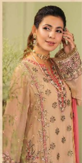
M-41 nargiz aabi