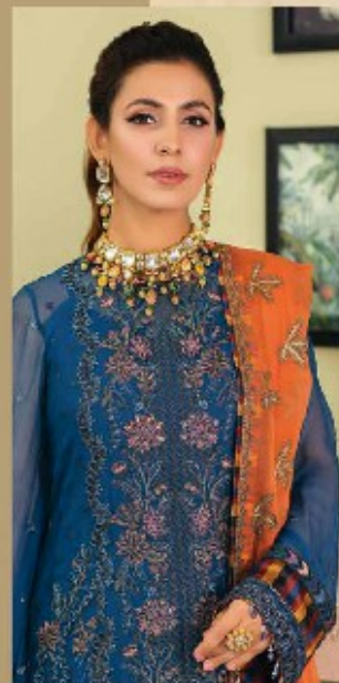
M-47 Gull Bahar

Majestic by Imrozia Premium the collection features a captivating array of designs, traditional yet modern motifs and contemporary aesthetics, delicate floral patterns to exquisite embellishments with attractive color palettes, perfect designs for your occasions.