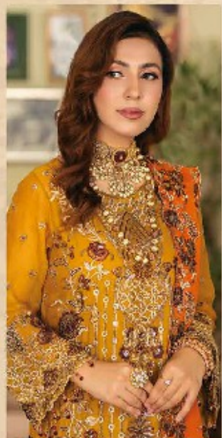
M-42 Gull e Chandni