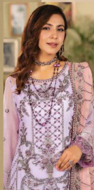
M-46 Gull Lala